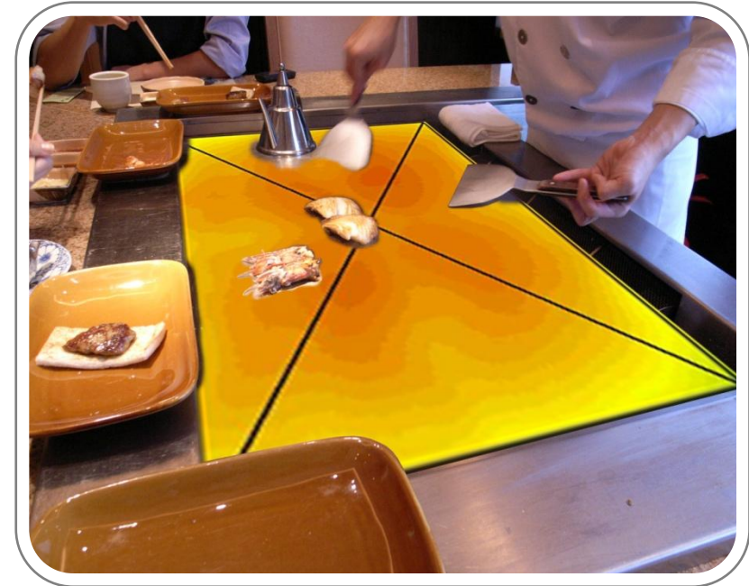
Even heat Spread on a teppanyaki table.....